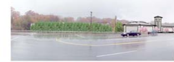
PROPOSED VIEW WITH SCREENING VIEW FROM 123 SOUTH BOUND OFF RAMP