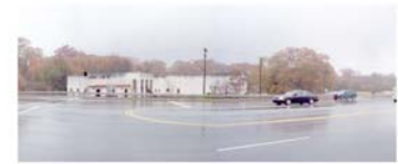
PRESENT VIEW VIEW FROM 123 SOUTH BOUND OFF RAMP